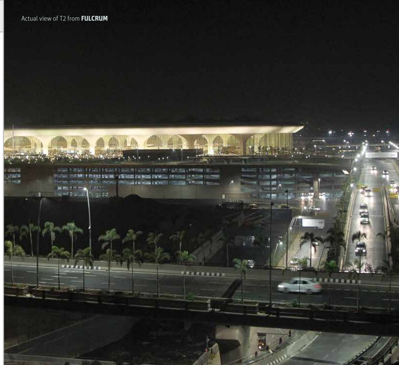
Actual view of T2 from FULCRUM