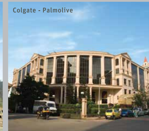
Colgate - Palmolive