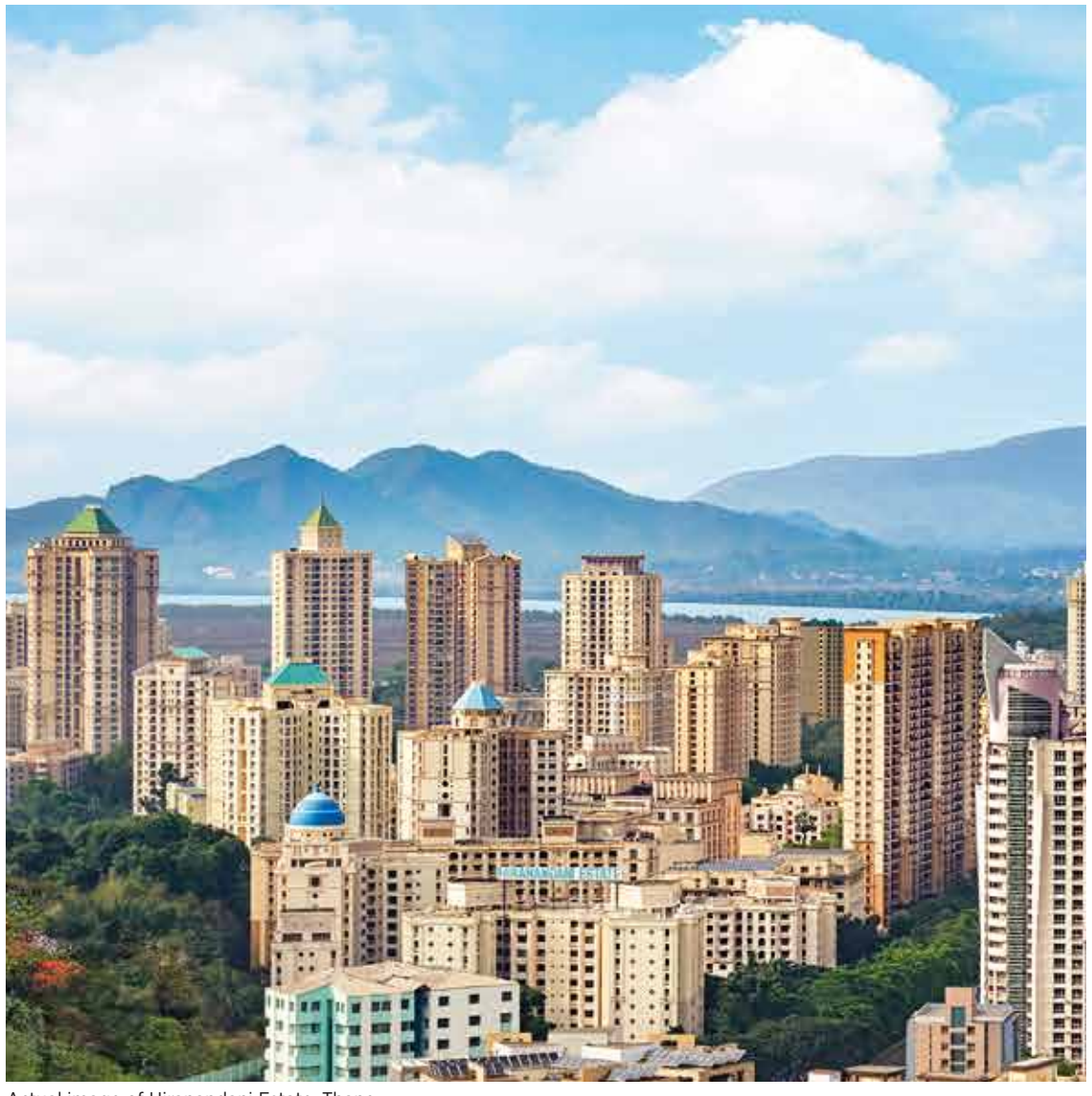
Actual image of Hiranandani Estate, Thane

Hiranandani, that has turned a million dreams into reality, has transformed the lives of 7000+ families at Hiranandani Estate, Thane. It's a name that is synonymous with the word 'community living'. With innumerable joyous faces and satisfied families living amidst a green belt adorned with brilliant architecture and recreational amenities, Hiranandani Estate, turns out to be an abode for every dream.