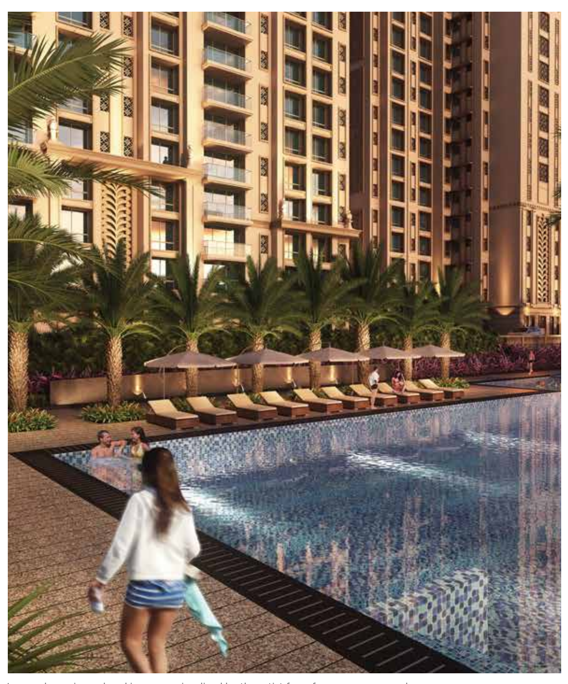
Image shown is rendered image as visualised by the artist for reference purpose only.