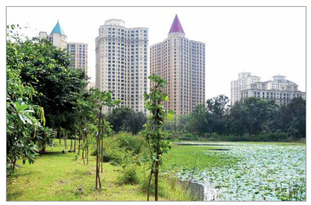
A Pristine Lake