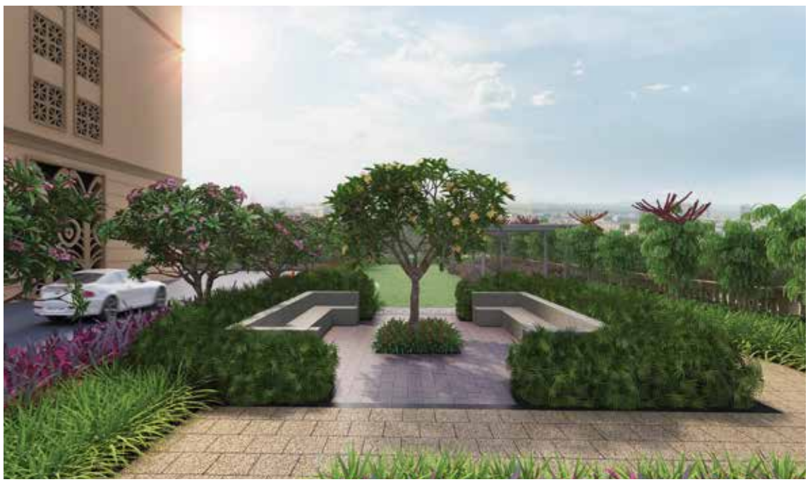
Images shown are rendered images as visualised by the artist for reference purpose only.