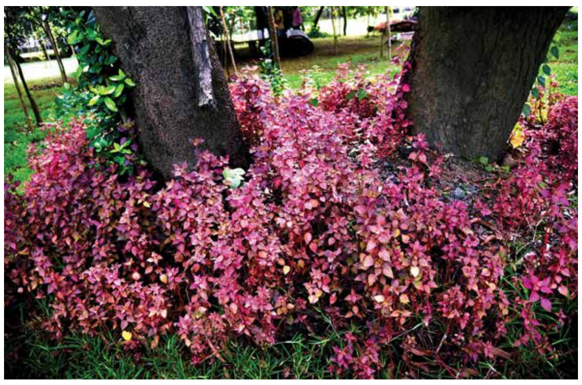
A Blossoming Beauty