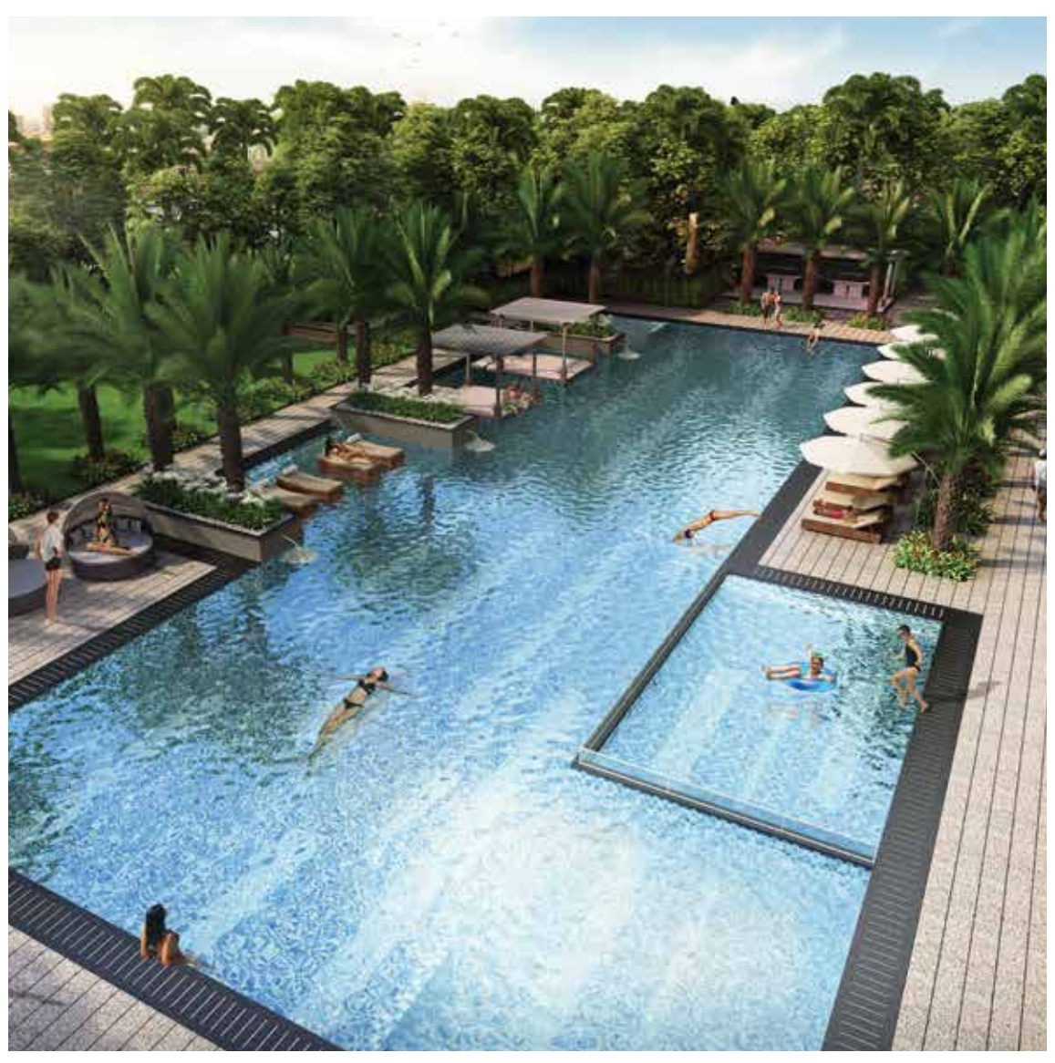
This is a rendered image as visualised by the artist for reference purpose only.

The most pleasant way to cool off on a summer day is to treat yourself with a brisk swim in the life-sized pool here or simply park yourself by the edge of the lake.