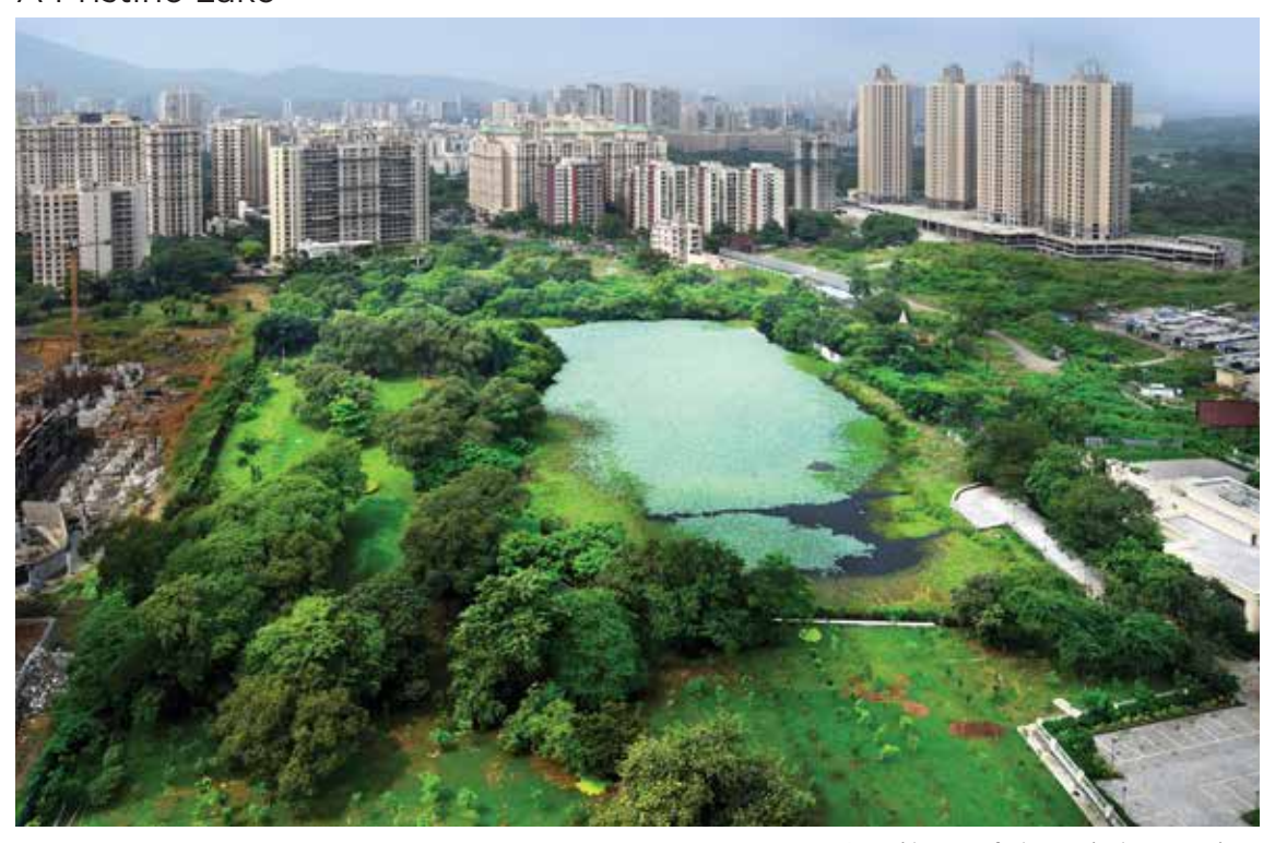
Nature's Pure Bliss