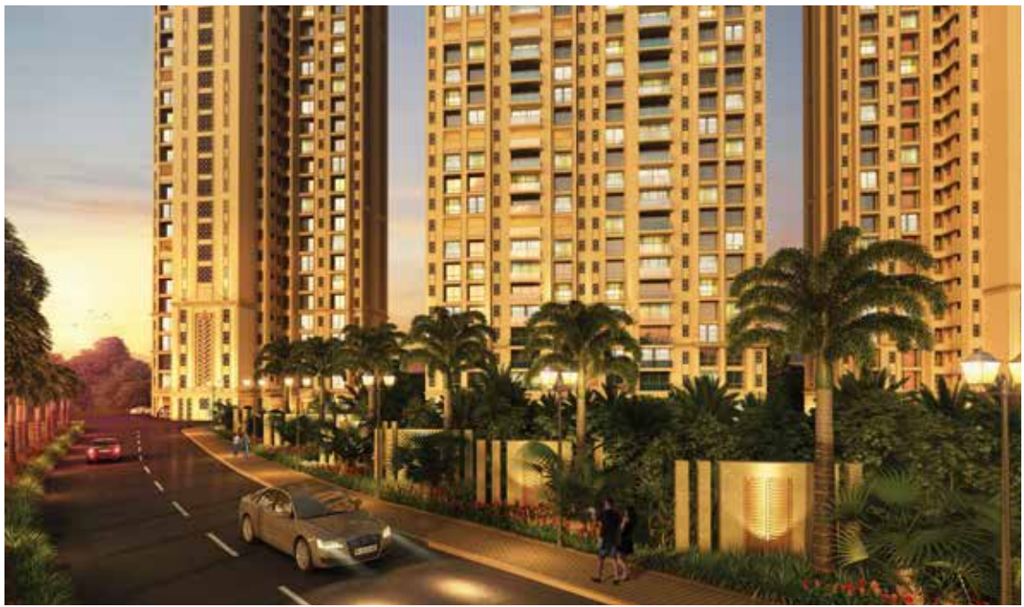
Images shown are rendered images as visualised by the artist for reference purpose only.