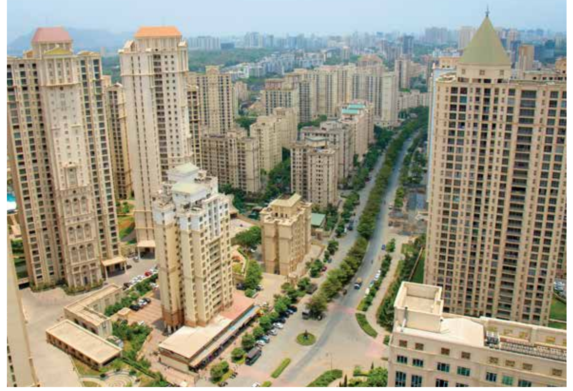
Actual image of Hiranandani Estate, Thane

In recent years, Thane has emerged as a preferred destination for home buyers. The slew of mega infrastructure projects will augur well for real estate development and certainly enhance the standard of the living quotient in the city. This will help the buyer and investors to fetch better returns and good price appreciation in the future. The city also enjoys the best social - civic ecosystem with prominent schools, colleges, and educational institutions, best of healthcare, entertainment zones, malls & organized retail spaces to enrich the quality of living.