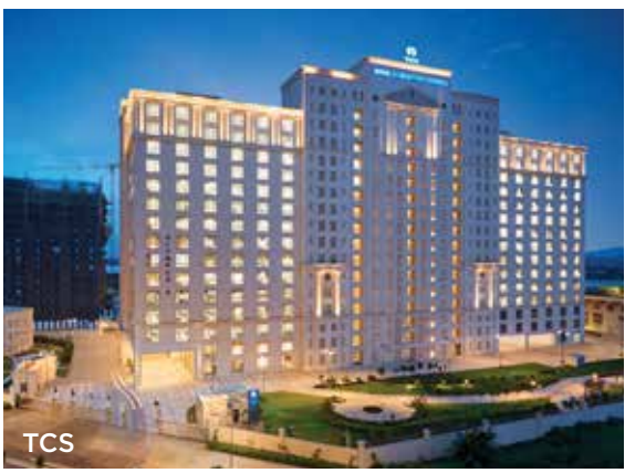
All are actual images of Hiranandani Estate, Thane.