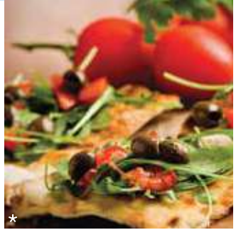
Fine Dining, Restaurants and Cafes