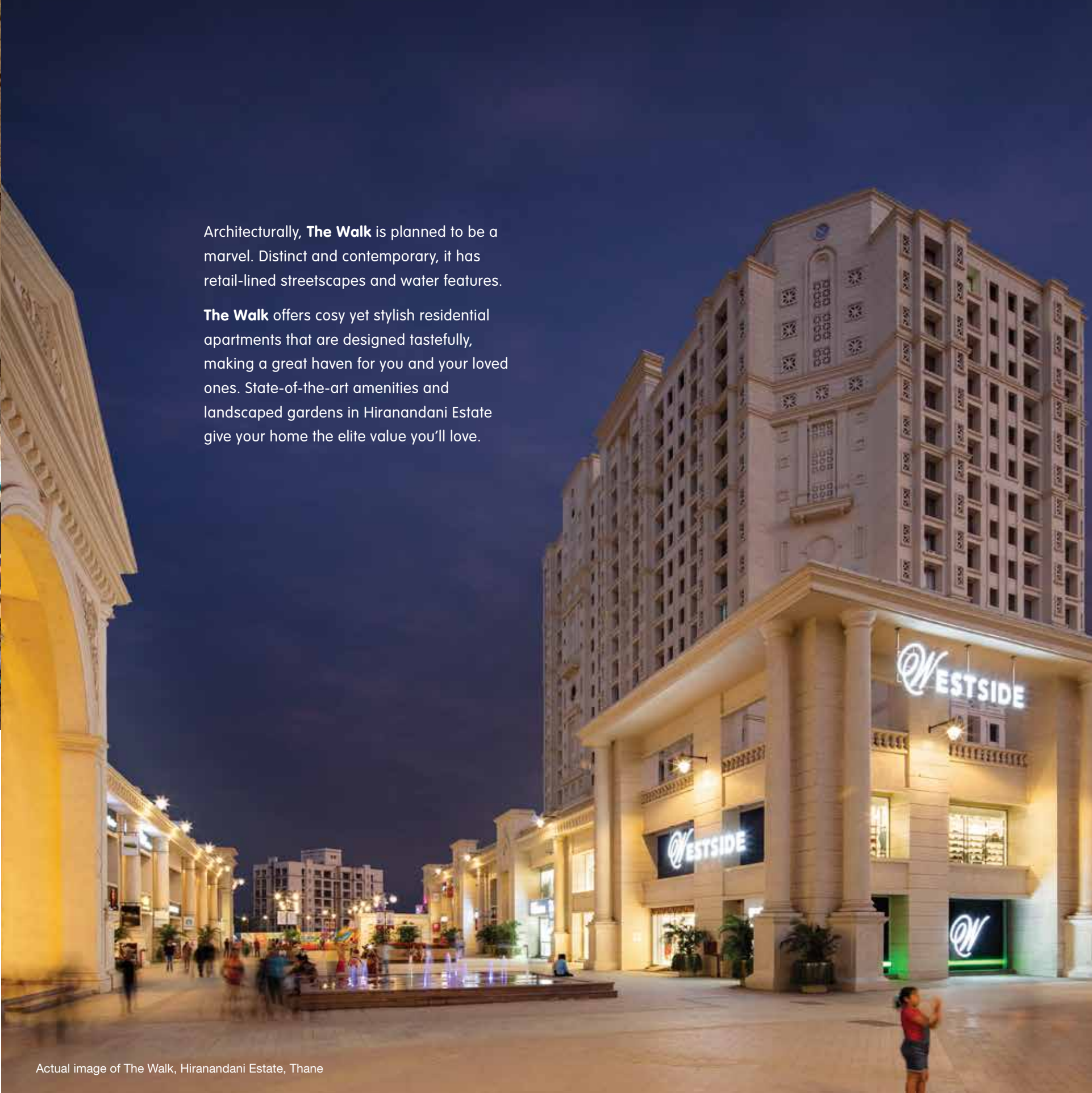
Actual image of The Walk, Hiranandani Estate, Thane

The Walk offers cosy yet stylish residential apartments that are designed tastefully, making a great haven for you and your loved ones. State-of-the-art amenities and landscaped gardens in Hiranandani Estate give your home the elite value you'll love.