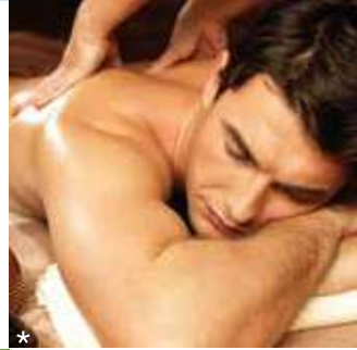
Beauty and Wellness Centre