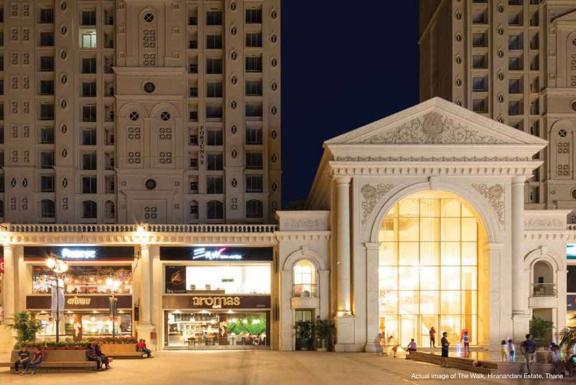
Actual image of The Walk, Hiranandani Estate, Thane