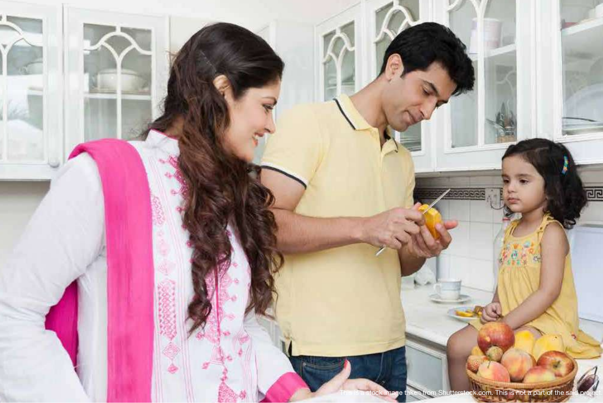
This is a stock image taken from Shutterstock.com. This is not a part of the said project.