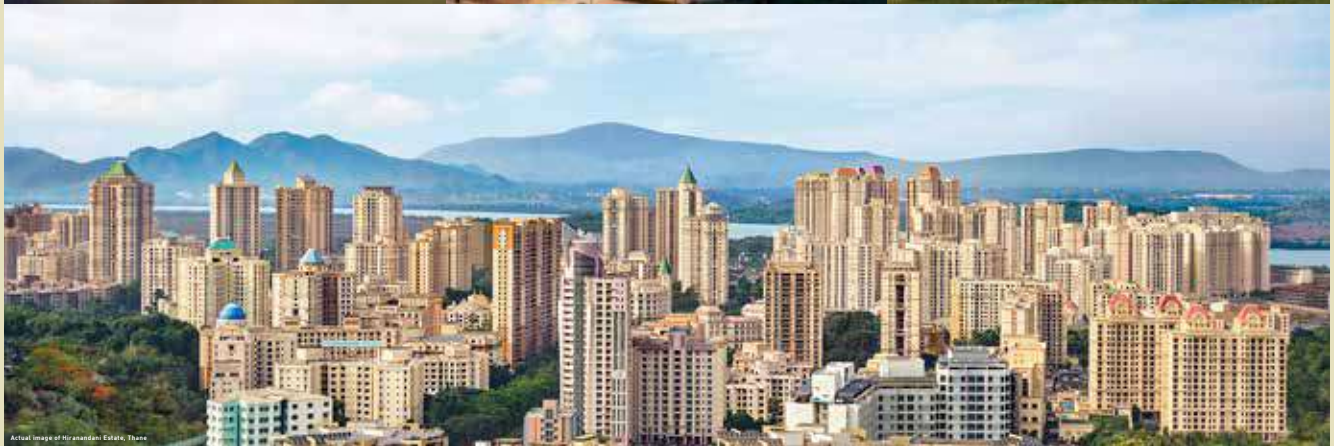
Actual Image of Hiranandani Estate, Thane

TOWNSHIP FEATURES - Hiranandani Foundation School • Hiranandani Hospital • Clubhouse • Gymnasium • Squash Courts Badminton Courts • Landscaped Gardens • Pedestrian-friendly, Tree-lined avenues • The Walk - High Street Retail