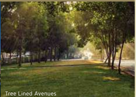
Tree Lined Avenues