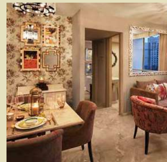
The above image shown is of show apartment of Fortuna for reference purpose only. The furniture & fixtures shown in the above flat are not part of the apartment amenities.