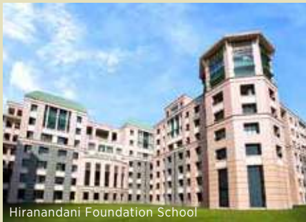
Hiranandani Foundation School