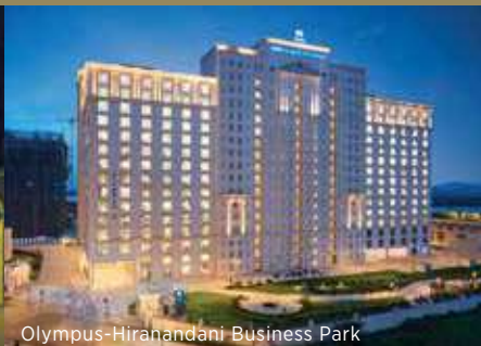
Olympus-Hiranandani Business Park