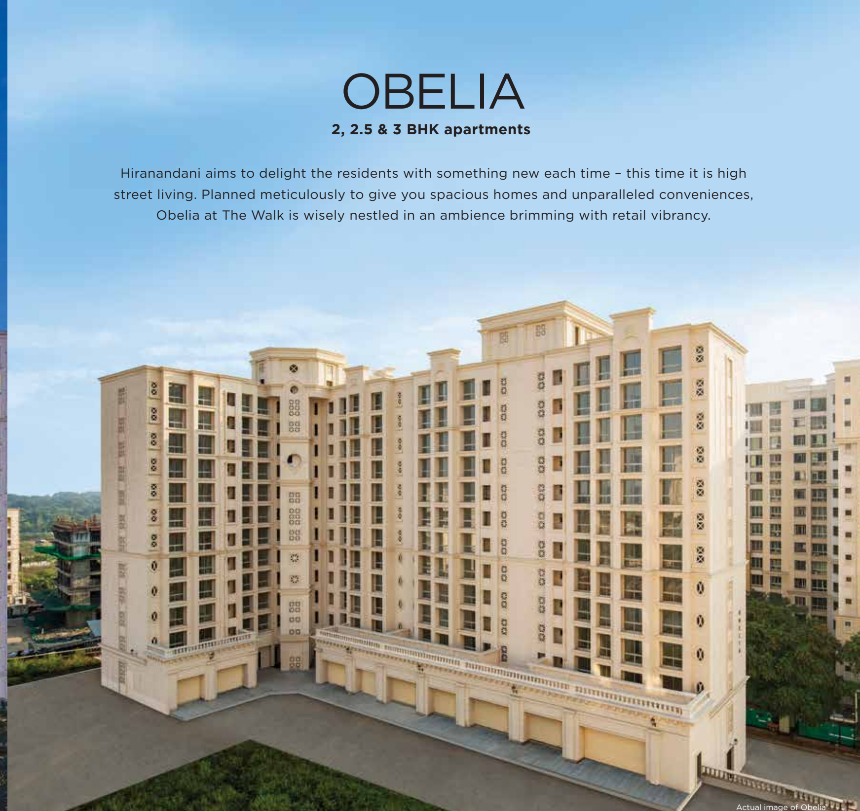
Actual image of Obelia

Hiranandani aims to delight the residents with something new each time – this time it is high street living. Planned meticulously to give you spacious homes and unparalleled conveniences, Obelia at The Walk is wisely nestled in an ambience brimming with retail vibrancy.